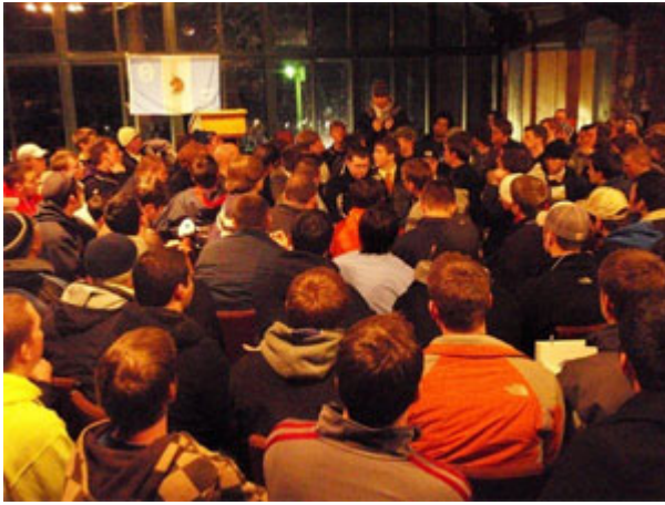
The entire group gathered for introductory activities early in the program.