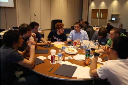
Pictured: All brothers from Alpha Chapter who attended.