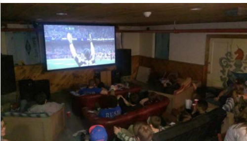
Brothers enjoy the Super Bowl on our newly installed HD projector screen in the basement